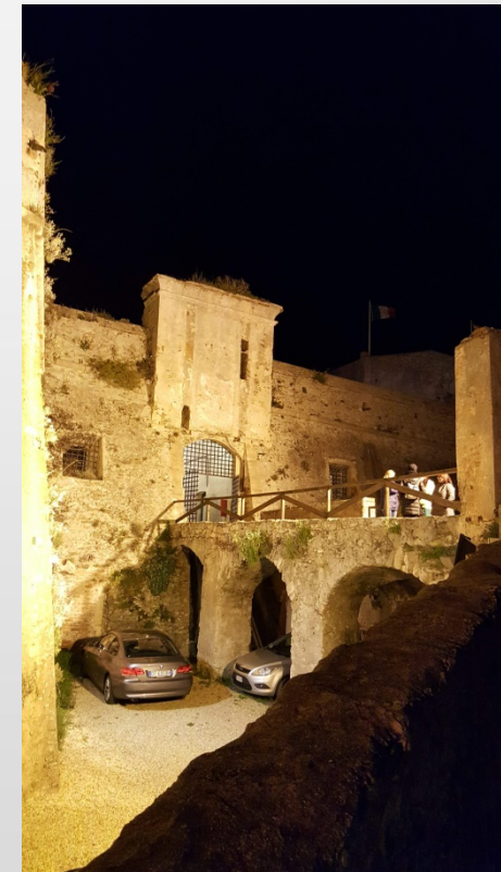
The main gate