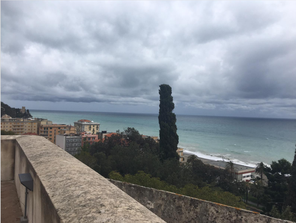
The view from the fortress