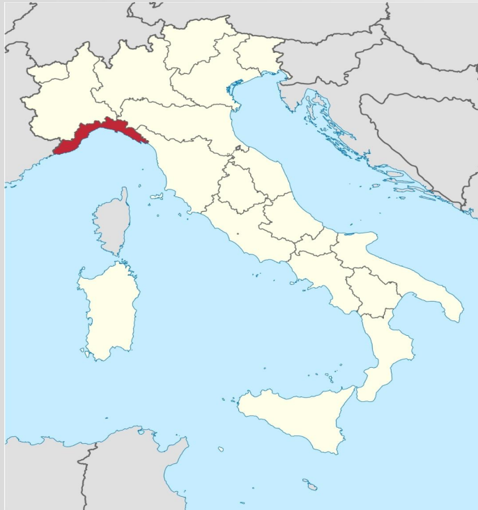
Map of the country